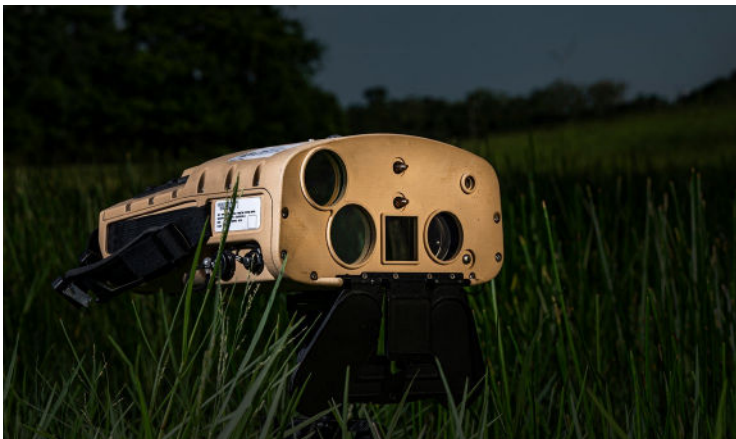
Incorporated into Marine Corp NGHTS handheld.